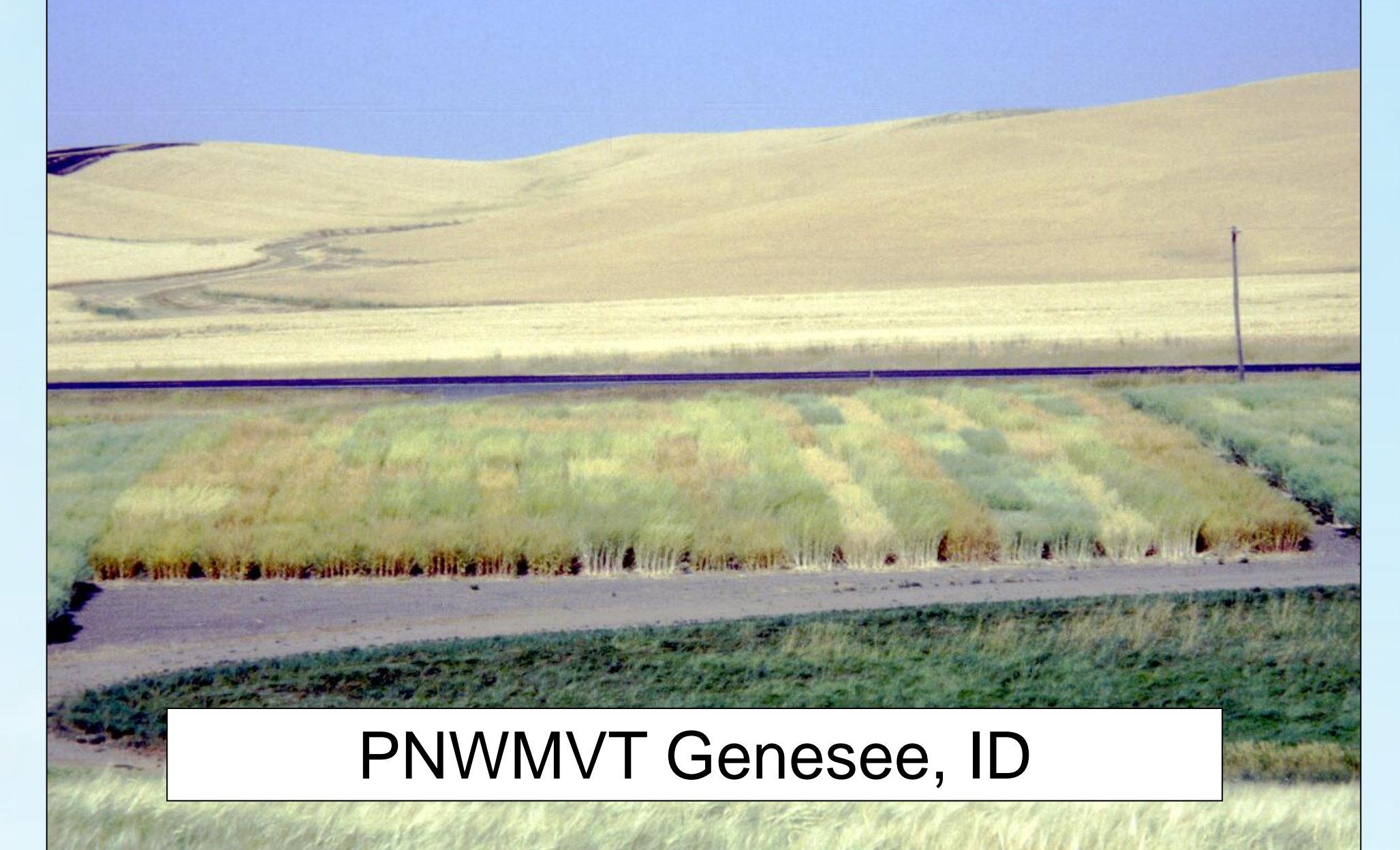
PNWMVT Genesee, ID

The agricultural community in the Pacific Northwest continues to show a strong interest in winter and spring canola or rapeseed ( Brassica napus and B. rapa ) and in condiment mustard ( Sinapis alba and B. juncea ). Canola and mustard offer growers an alternate crop for rotation in an agricultural system predominated by small cereal grains. Comprehensive yield trials are needed to evaluate new cultivars and to determine which areas of the Pacific Northwest are best suited to the available cultivars. With this objective in mind, researchers at the University of Idaho established the Pacific Northwest Canola Variety Trial during 1994 to test spring canola. In 1996, a winter canola trial and a mustard trial were added. The trials are funded in part by the PNW Canola Research Program, the Idaho Oilseed Commission, the University of Idaho, and by fees paid by the commercial companies that submit their cultivars for testing.